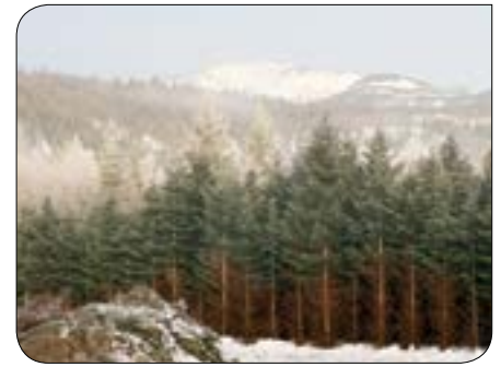
Highland Flats, Idaho