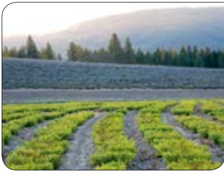
St. Maries, Idaho